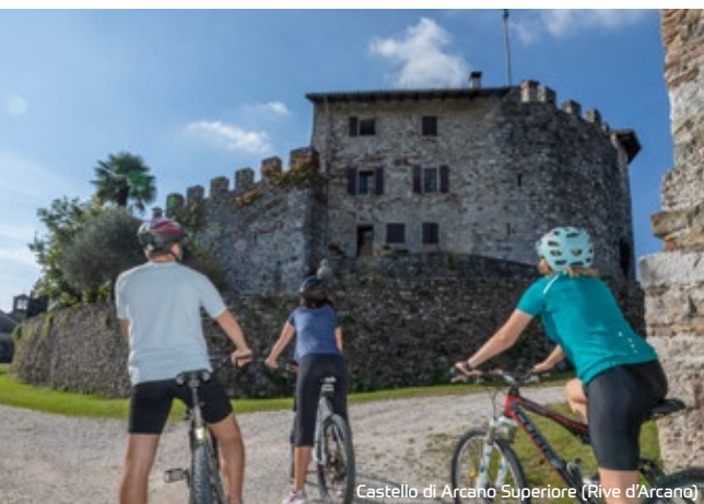
Castello di Arcano Superiore (Rive d'Arcano)