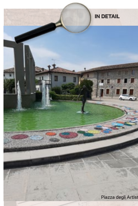
Piazza degli Artisti