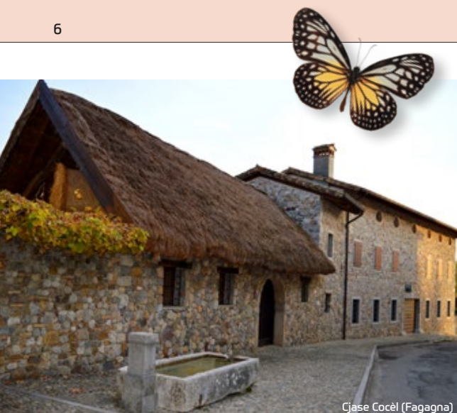
Cjase Cocèl (Fagagna)