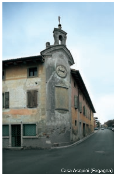
Casa Asquini (Fagagna)

cano Inferiore. At the crossroads we turn left entering the village, visiting the Church of San Giorgio, returning back to the crossroads. We turn left and cover a stretch of 500 meters downhill, after which we continue to the left and go straight up to a STOP sign. Here we turn left and, after 300 meters, right at the following junction in the hamlet of Raucicco, along Via Giovanni XXIII for about 0.5 km. Arrived at a crossroads, we turn left alongside the Ledra canal up to the intersection with the main road with