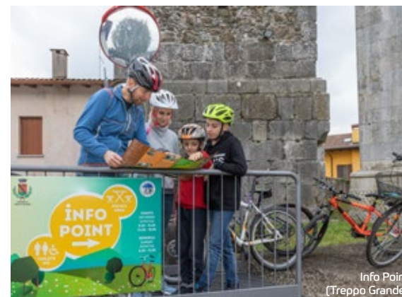
Info Point (Treppo Grande)

We proceed for over 600 meters going straight at two consecutive intersections, following the signs for Osoppo and getting back onto the dirt road. However, this stretch is short and, reaching the intersection with the Osovana provincial road, we pass it continuing for another 2 km, up to the crossroads at the level crossing, where we turn left onto Via Brigata Re to reach, after a few hundred meters, the square of the Osoppo Railway Station, where the excursion ends after 35.5 km in total.