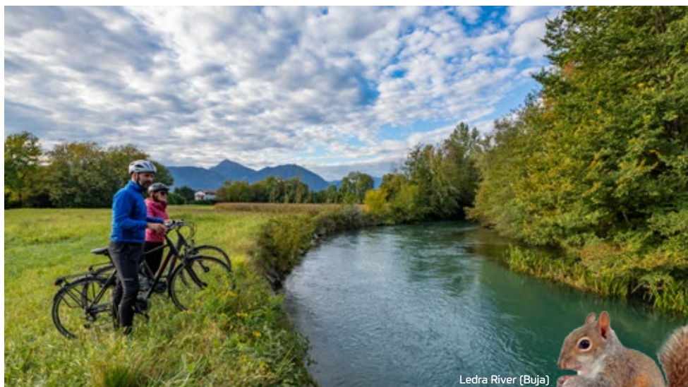
Ledra River (Buja)