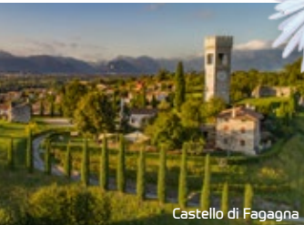
Castello di Fagagna