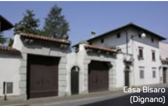
Casa Bisaro (Dignano)