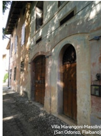
Villa Marangoni-Masolini (San Odorico, Flaibano)