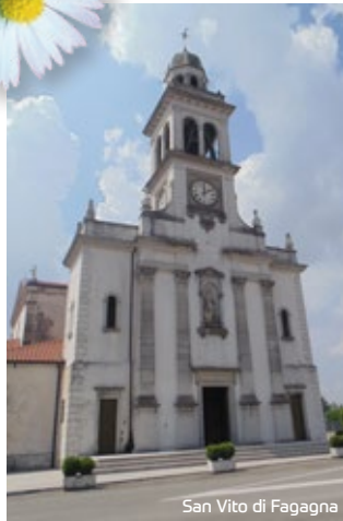
San Vito di Fagagna