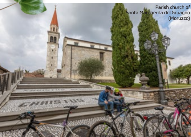
Parish church of Santa Margherita del Gruagno (Moruzzo)

We reach the church of San Silvestro : after the visit we go back on the same route to the roundabout near the Town Hall, where we continue straight and turn left onto Via Divisione Julia at the following intersection with a STOP sign. At the crossroads, after another 500 meters, we turn left and go downhill for about 350 meters before turning right onto Via Sant'Antonio; at the following crossroads near the church (17.7 km in total) we continue straight on Via Alnicco. After more than 1 km we reach the STOP sign on S.P.59 near the Church of SS. Pietro e Paolo : here we turn right towards Moruzzo and reach the crossroads at the restaurant "Al Fogolar" (19.8 km in total), where we turn left onto Via Sant'Andrea. After passing the small church of Sant'Andrea in Brazzacco di Sotto we again merge onto S.P.59 at the following intersection with a STOP sign, where we continue straight on Via Colloredo until the following crossroads, where we take Via San Michele to the left. Here begins a stretch of dirt road about 1 km long.