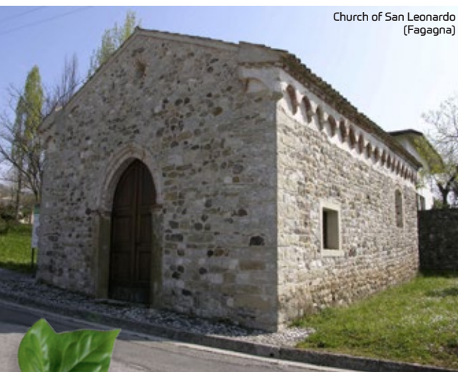
Church of San Leonardo (Fagagna)

A few tens of meters and we turn right onto Via Torreano reaching the hamlet of the same name, then at the following intersection we take Via Plaino to the left up to Villa di Prampero di Torreano di Martignacco. Resuming the journey we continue straight up to the crossroads, where we turn left staying on Via Plaino and, upon reaching the intersection with S.P.59 (11.6 km in total), we turn right. Shortly after we reach the Sanctuary of the Madonna della Tavella , dating back to the XII century. We go back and, having reached the junction with Via Torreano, we turn right towards Pagnacco. After passing the former Plaino dairy, of considerable architectural value, we continue straight on Via della Villa and arrive at the crossroads at villa Linda, which we bypass by turning left along Via Zampis. We continue straight along Via Zampis, going through an underpass and we arrive at a STOP sign where we turn left to reach the following junction for Pagnacco on a mixed cycle path (14.4 km in total), where we turn right. At the crossroads near the Town Hall of Pagnacco, we take Via Castellerio to the right and continue on Via degli Orti, turning right at the following junction.