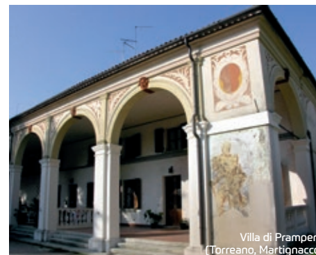
Villa di Prampero (Torreano, Martignacco)

After 600 meters, at the crossroads we turn left and continue for a further 700 meters up to the asphalted road. We thus cross a typical rural settlement, " Borgo Modotto ",